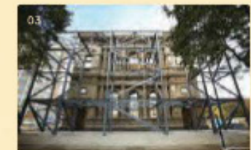
02. Staircase detail, above and below 03. Preservation of the existing facade 04. Coffered ceiling in place over the main stair core 05. Erection of the main stair core.